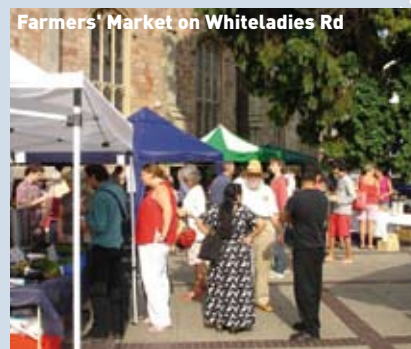
Farmers' Market on Whiteladies Rd

Ffi: www.sustainableredland.org.uk Hamish also runs training courses on starting climate change groups: email hamishwills@btinternet.com